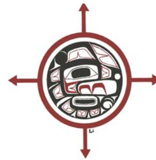
Union of British Columbia Indian Chiefs