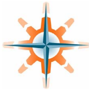
First Nations Summit